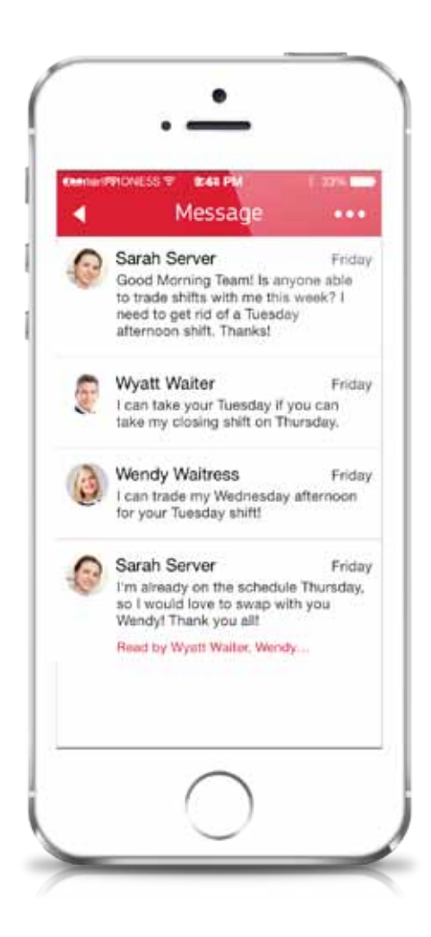
Caption to be written

Where there are challenges, there are solutions, but there are also issues and ideas on the bleeding edge to keep in mind for the coming year. What good is surveying a panel of experts if you don't get their take on what is coming?