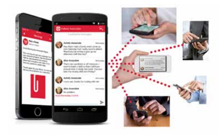
find new ways to connect with people from all walks of life

On the surface, the field of internal communications seems rather simple - communications within a company. Whether in its typical implementation - from company to employees - or in the more open, modern approaches of engaging in a dialogue, the concept isn't complex.