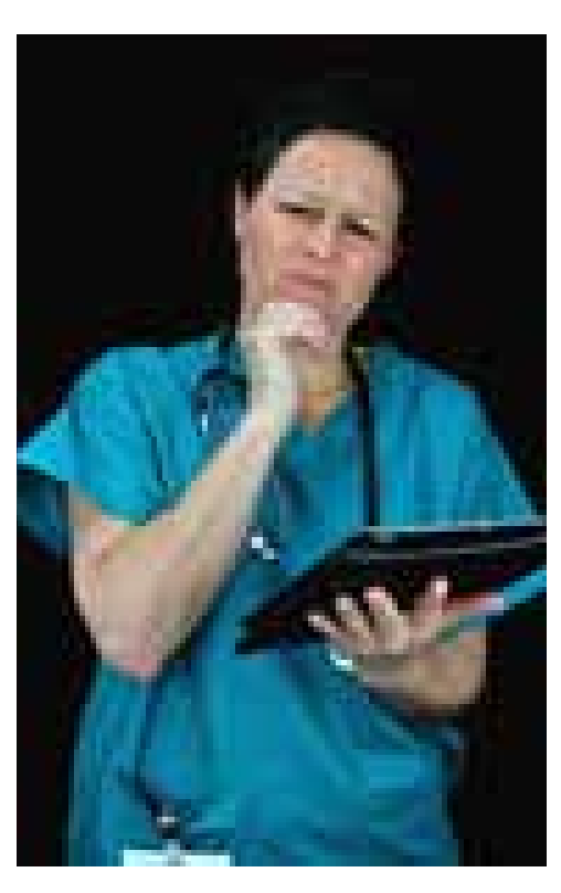
Verbal noise and confusion are common in retail, hospital and restaurant workers.